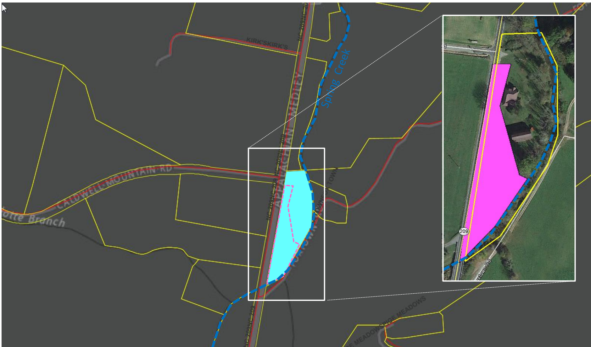
Figure 2. The area around the Meadows heirs' property (solid light blue), showing other tax parcels with yellow outlines. Within the subject property, the outline of the one-acre 1925 land purchase is shown with a magenta dashed line. The inset map is a satellite image showing that the barn and house structures on the current property are outside the bounds of the 1925 purchase. Spring Creek is shown in both maps with a blue dashed line. Note the current property outline does not explicitly follow the current course of the creek.