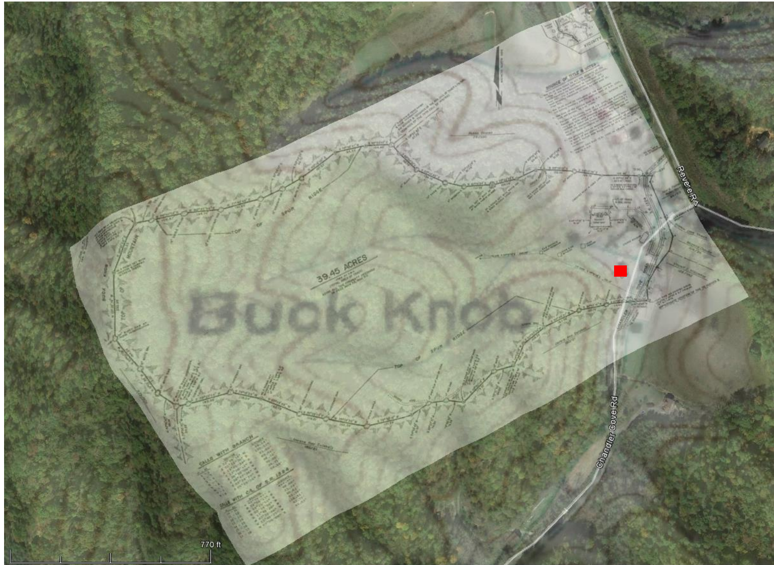
Figure 3. Google Earth image, with topographic overlay, also showing the 1995 surveyed plat completed for R. Carl Mumpower. The Chandler/Ramsey Barn is shown in red near the eastern edge of the tract. The description included in the 1931 deed (Ervin Ramsey to the Catholic Church) could generally be followed using the surveyed boundaries shown, though none of the older deeds included details that would allow them to be transferred onto modern maps.